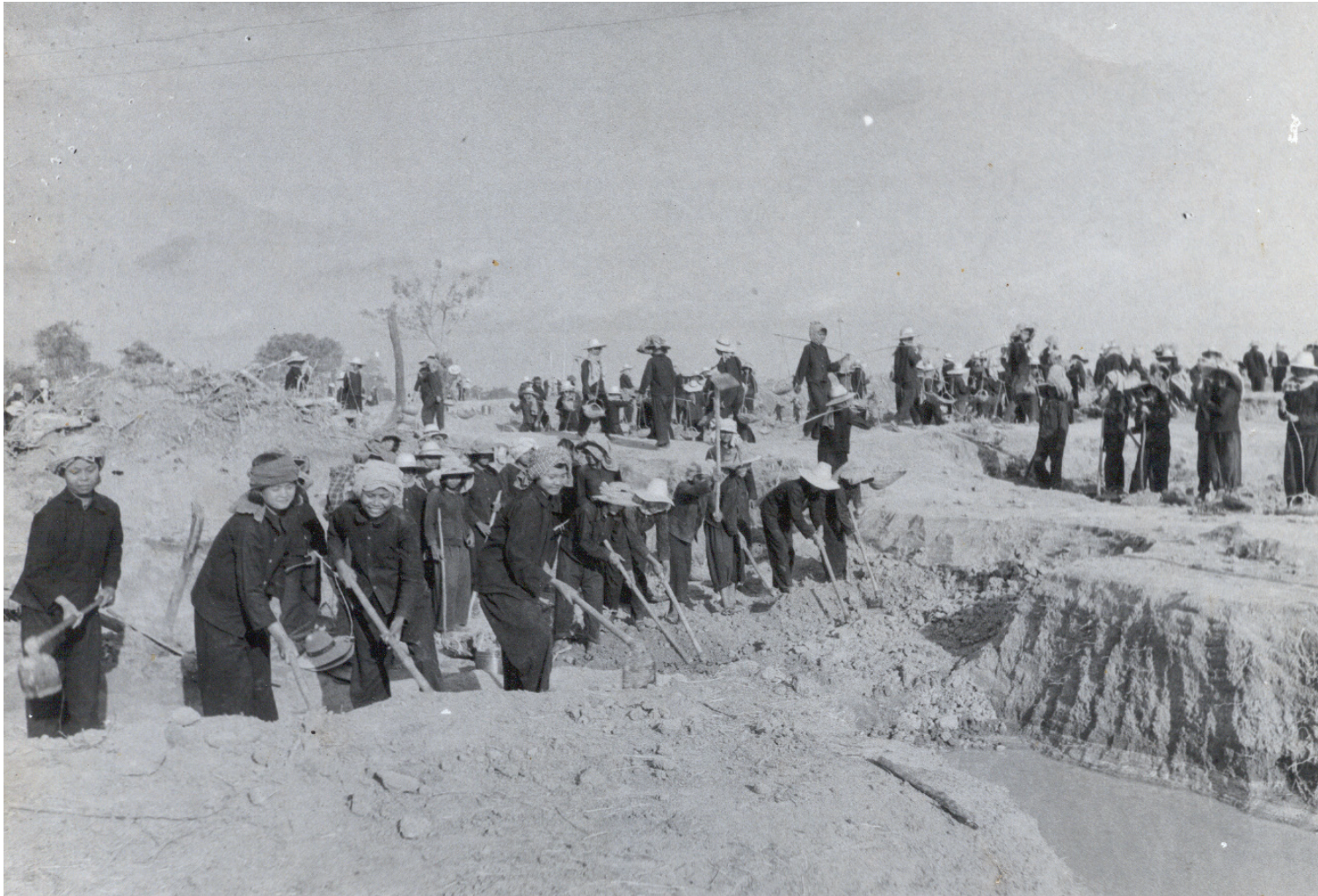
Women and men team carrying earth during the Khmer Rouge regime. This photo was taken during the visit of Khmer Rouge high-ranking cadres or what could have been a group of foreign dignitaries and their Khmer Rouge hosts. Each time visits were made, everyone was told to dress up the best way they could or sometimes they were provided clothes and Krama temporarily. When the cadres visited the site, everyone was usually told to smile for the camera and for the visiting cadres.