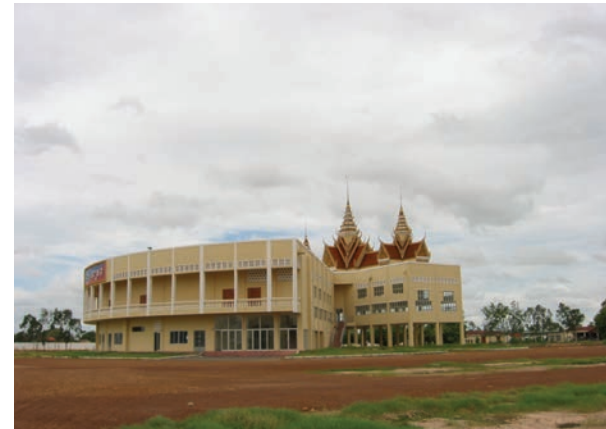
LEFT: Civil parties in case 002 before the Khmer Rouge Tribunal meet in Phnom Penh to select their legal representatives, 2010; RIGHT: The courtroom of the Khmer Rouge tribunal. Designed and built out of the 'Theater Hall' of the Military Base of the Royal Cambodian Armed Forces, the building had never been used before it was lent to the Khmer Rouge tribunal in 2006. The facility can accommodate 550 people.