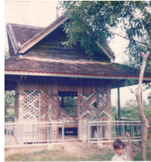
LEFT: Clergymen and monks conducting Buddhist religious ceremony in front of the skulls of those who died during the Khmer Rouge regime. In Buddhism, it is believed that those who died violent deaths face great difficulty in becoming reborn. RIGHT: Bones and skeletons of those who died during the Khmer Rouge regime can still be found throughout the country. Very often, local authorities collected these bones and skeletons and placed them in a central location such as an abandoned school, house, or cottage. In this picture, skulls and bones were placed in a small building with unprotected care. These places serve as sacred areas in which survivors can come and honor their relatives who died during the Khmer Rouge regime.