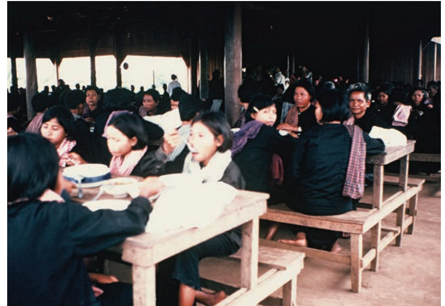
LEFT: Children carrying farm tools in a labor camp. Children and teenagers were often assembled into units (in this case a 'teenager unit') for the purpose of labor and discipline. They were beaten and many died of starvation, illness and loneliness. Most youth who were members of these units were separated from their parents for years. Many children never saw their parents again. After 1979, there were over 200,000 orphans in Cambodia. Some of the children who survived this period, and who are now adults, have no idea what happened to their parents; RIGHT: Communal eating at the cooperative