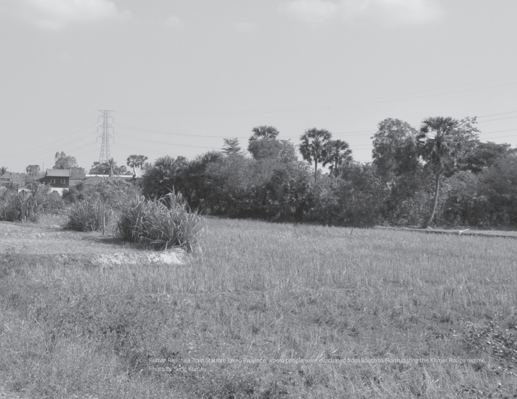
Kumar Reachea Train Station, Takeo Province, where people were evacuated from South to North during the Khmer Rouge regime.