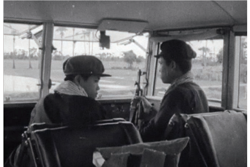
LEFT: Khmer Rouge leaders riding on a train; RIGHT: Young train drivers, most of whom were teenagers, took hundreds of thousands of Cambodian people from other parts of the country to the Northwest zone of Pursat and Battambang during the Khmer Rouge regime.