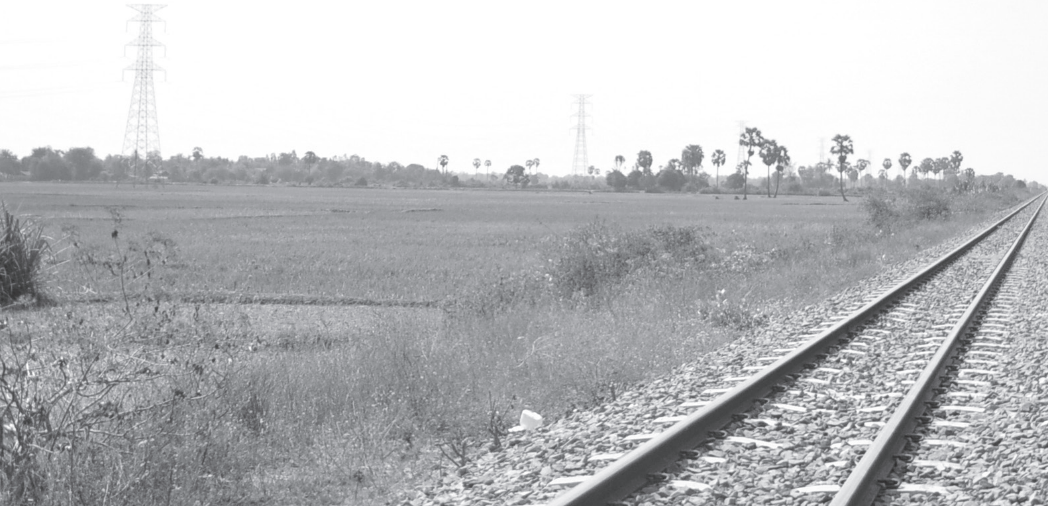
Kumar Reachea Train Station, Takeo Province, where people were evacuated from South to North during the Khmer Rouge Regime.