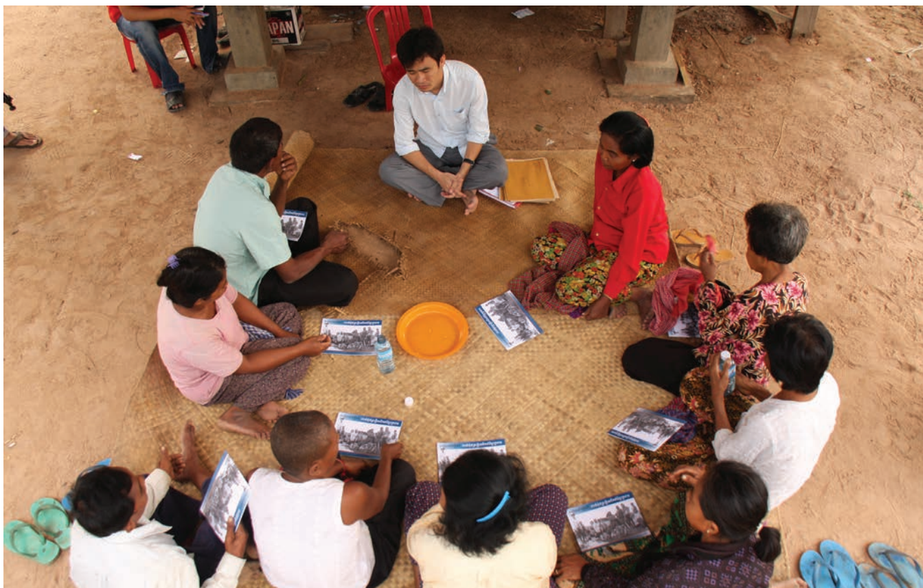
Khmer Rouge survivors participate in a meeting held by DC-Cam about their participation rights with the Khmer Rouge Tribunal, Kampong Thom Province, 2009