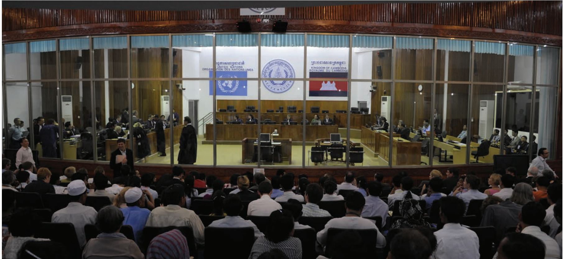
View inside the courtroom of the Khmer Rouge Tribunal, staffed by the United Nations and Cambodia. Each office of the tribunal consists of the UN and Cambodian personnel with Cambodian majority.