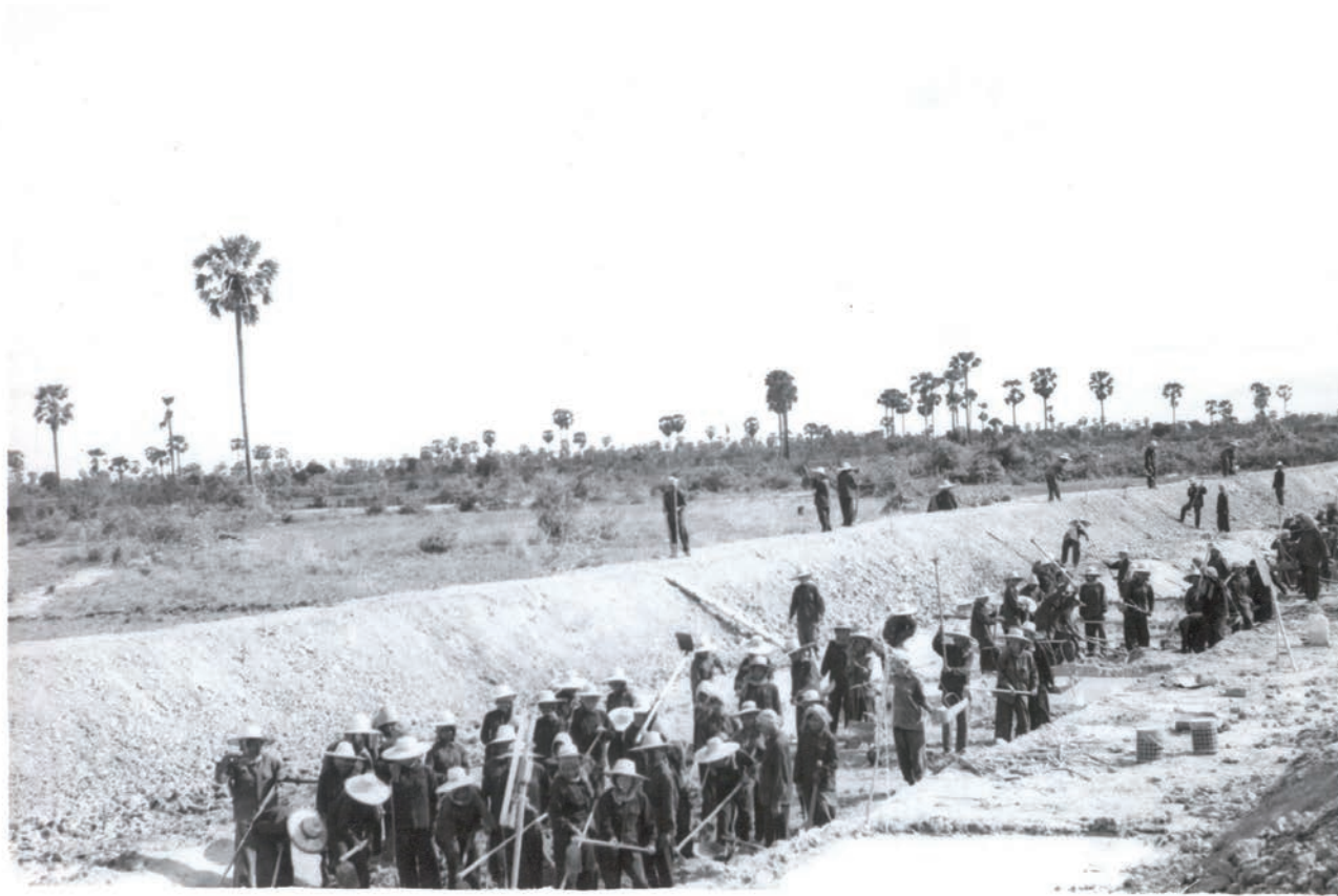
Cambodian people digging the dam in the suburb of Phnom Penh during the Khmer Rouge regime. All people were obliged to work during the regime. The Khmer Rouge regime compelled large portions of the population to conduct manual labor on a daily basis in order to increase the country's production of rice.