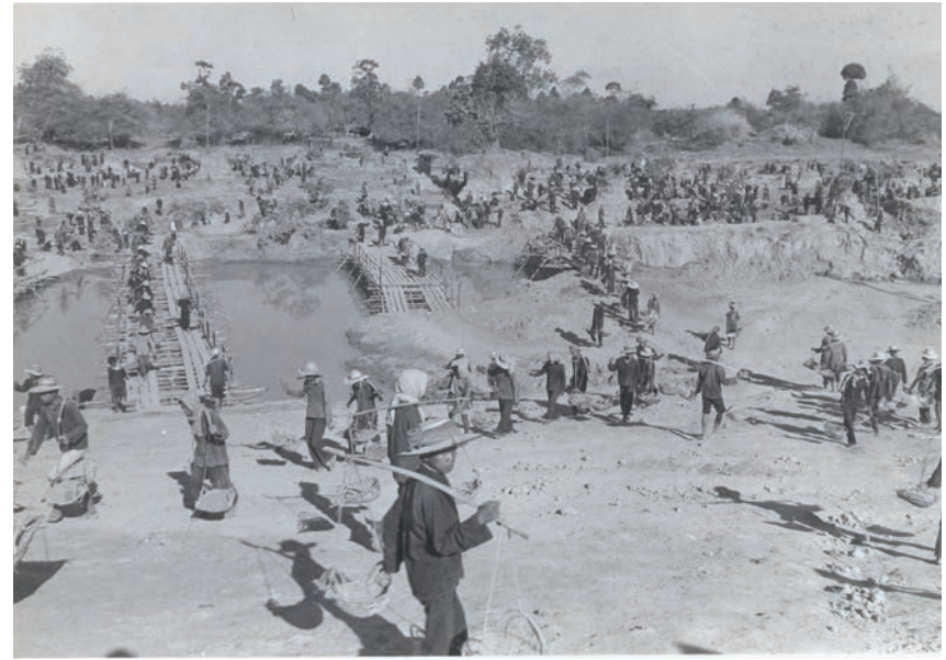
LEFT: Middle-aged men and women carrying earth during the construction of a dam during the Khmer Rouge regime. RIGHT: Men and women working at “1 January” dam near Chinith River, Kampong Thom province during the Khmer Rouge regime. This photo shows the busy labor camp under the hot sun surrounded by woods. It was taken during a high profile visit of Minister of Social Affairs Ieng Thirith.