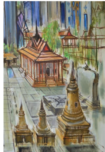
Painting of Wat Lang-Ka, Phnom Penh, Asasax Art Gallery

In this story, a wealthy man, who wanted to help his wife, died and became reincarnated as a crocodile. As a crocodile, he helped the village, but, amidst his efforts in helping the village, he grew tired and died. Ultimately, his good deeds became memorialized in the stars. Elders would tell this story to children under the night sky to entertain them, but it is more than just a children’s story. The Crocodile Star always symbolized hope and direction, guiding as much as encouraging people. As one survivor recalled, while the story consoled children (and even adults) on the train, it was not long before reality had consumed even our thoughts of imagination.”