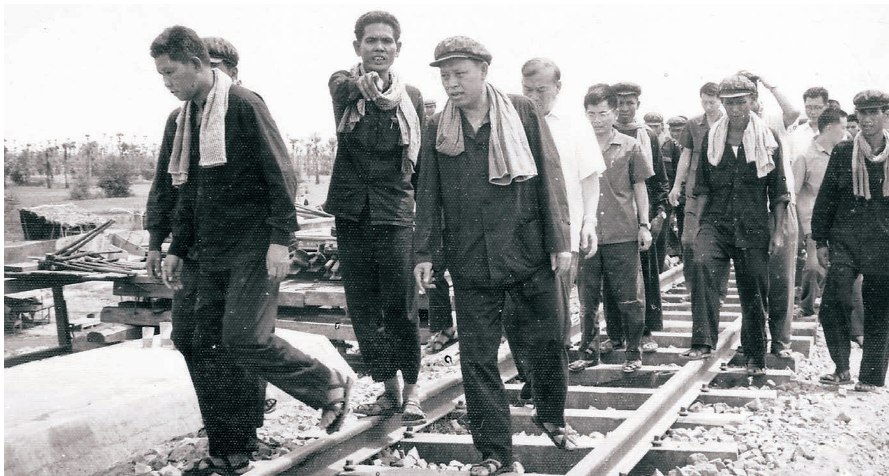
Leng Sary with a Chinese delegation inspecting the railway during the forced transfer of people in late 1975.