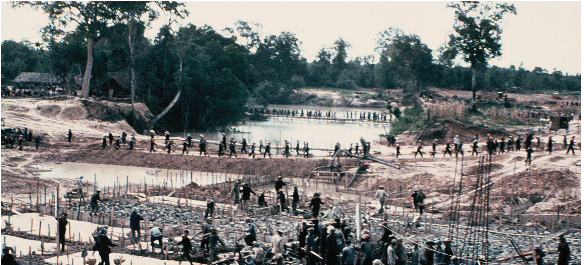
Irrigation dam construction on the road north.