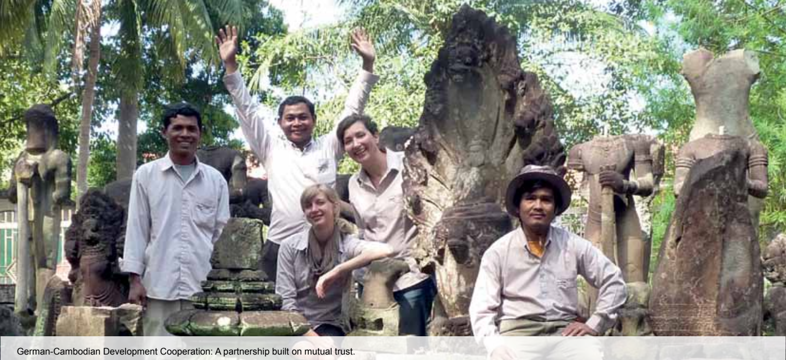
German-Cambodian Development Cooperation: A partnership built on mutual trust.