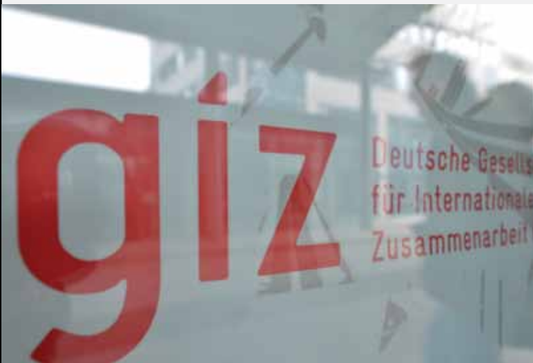
GIZ – a leading provider of international cooperation services for sustainable development.

Our work considers political, economic, social and ecological complexities that challenge development. Based on partners' needs we tailor our services to meet policy goals – at all levels.