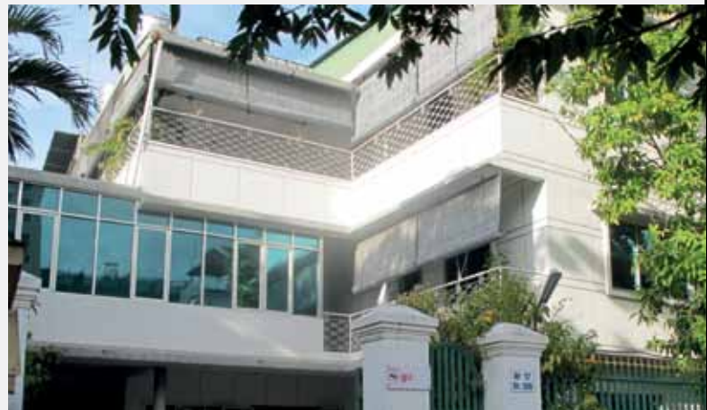
Over 240 international and local staff work for GIZ in Cambodia.

GIZ and the German Federal Employment Agency – places experts with local employers to support their work. And to prepare young women and men with invaluable international experiences, approximately 500 graduates are assigned abroad annually through our Weltwärts Programme.