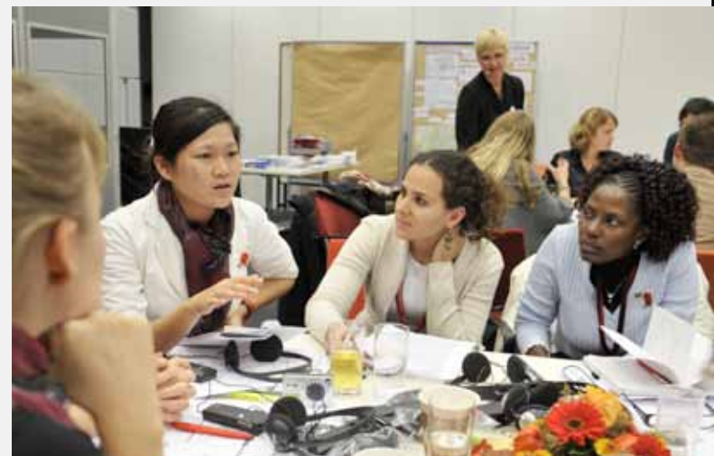
South-South Cooperation – exchanging expertise, innovating and sharing experiences.

Together with the Royal Government of Cambodia, our work fosters peace, justice and reconciliation.