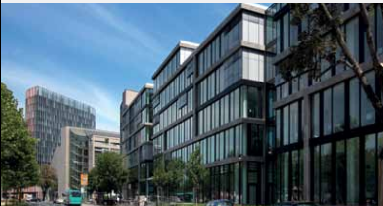
KfW Headquarters in Frankfurt, Germany – a place for innovation and decision making.

For more sustainability and promotion of domestic ownership, investment projects are jointly identified and mainly implemented by local or by our national partners. During project implementation, KfW closely monitors the process to meet safety and governance quality standards. When needed, KfW supports the partner government in the project implementation process. We do this through international experts with professional experience worldwide.