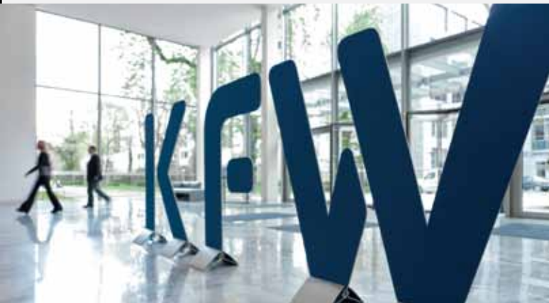
KfW – Germany's carrier of Financial Cooperation worldwide.

This includes the promotion of fairer globalization, natural resource protection and poverty reduction.