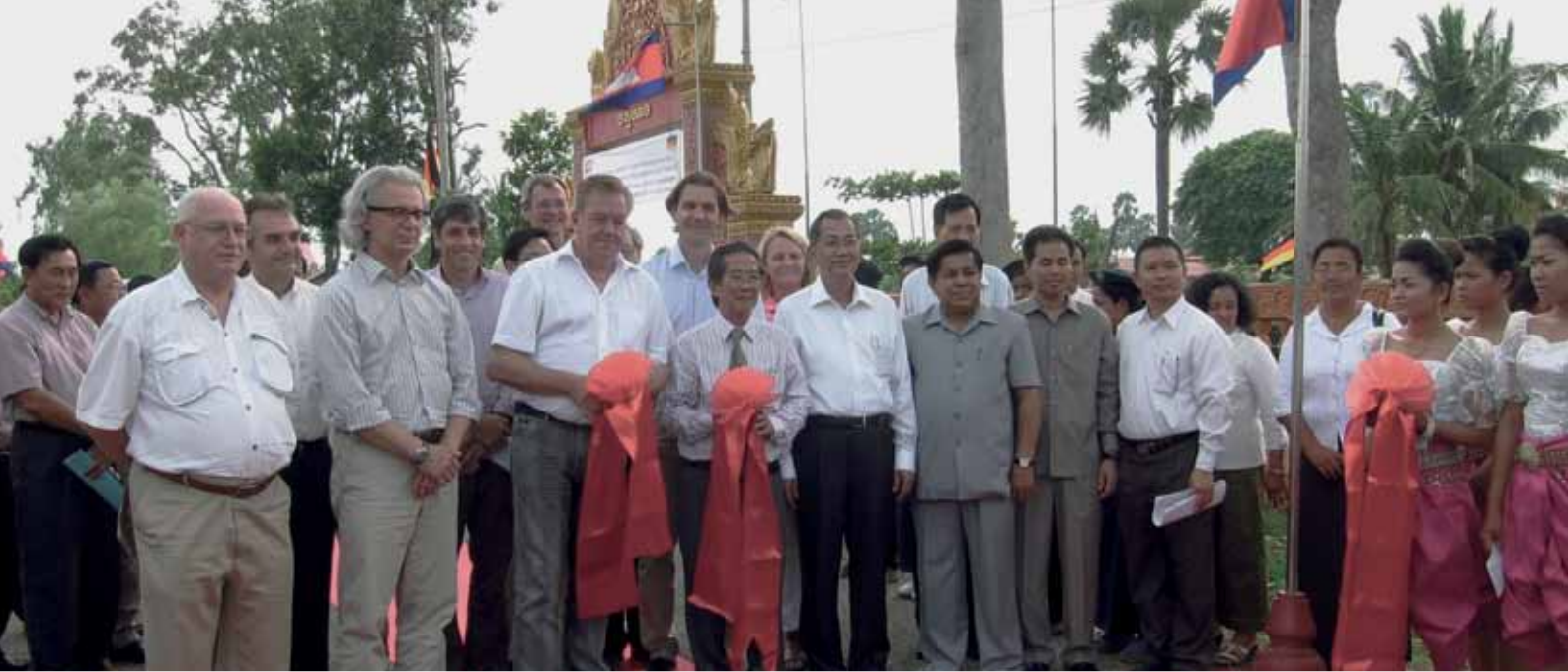
High-ranking German and Cambodian officials inaugurate a new road in Siem Reap Province.