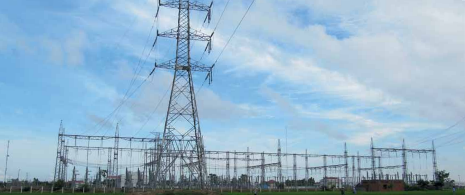
Financial Cooperation through KfW in Cambodia – connecting rural communities to electricity grid in Kampot Province.