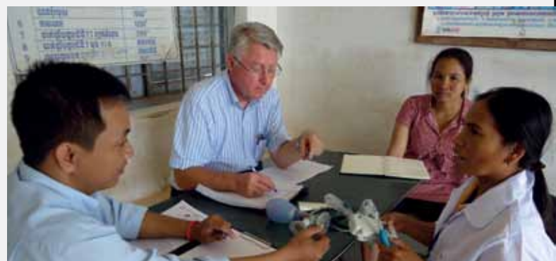
Technical experts provide advisory support to local health care providers. It's our way of finding a solution together.

Our German-Cambodian Cooperation is making a difference. We are working hand-in-hand with local partners towards our common goals in projects: economically viable and socially equitable investments that effectively reduce poverty, promote gender equality and boost growth.