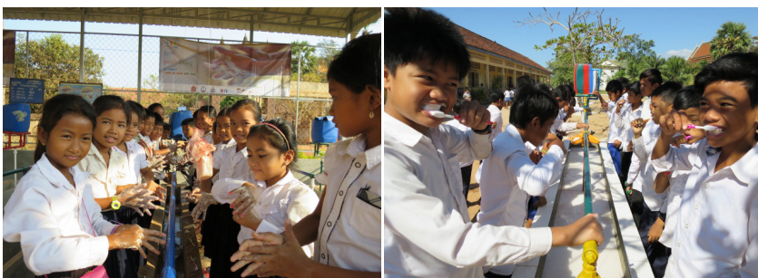
Photo left: Global Hand Washing Day at Ang Phnom Thoch primary school in Angkor Chey district in Kampot province

Recognising school-based management as an important cornerstone, the Fit for School approach strengthens the capacity of the education sector to manage WASH in schools. As a result,